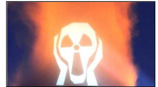
Impact of Fukushima