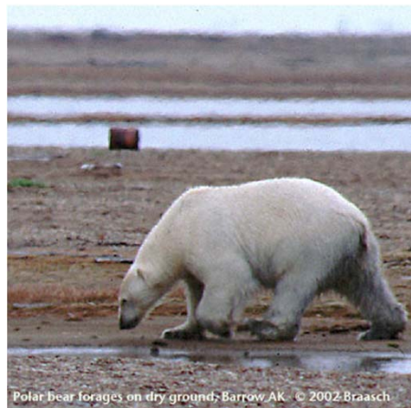
Polar Bear forages on dry ground, Barrow AK.